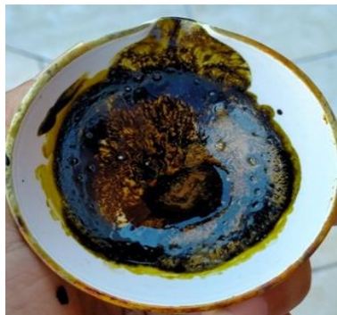
Figure 3. Phytochemical test results of flavonoid compounds using concentrated HCl and magnesium

The results of the phytochemical test of flavonoid compounds by reacting ethanol extract of avocado leaves ( Persea americana Mill.) with concentrated HCl and 3–4 pieces of Mg metal showed a color change in the precipitate to red or orange.