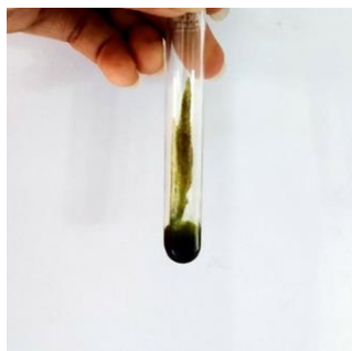
Figure 6. Phytochemical test results of triterpenoid/steroid compounds using acetic acid and sulfuric acid

The results of the phytochemical test of saponin compounds by reacting ethanol extract of avocado leaves ( Persea americana Mill.) with 10 ml distilled water and adding 10 ml alcohol showed foam with a height of 3.5 cm that remained stable for 10 minutes.