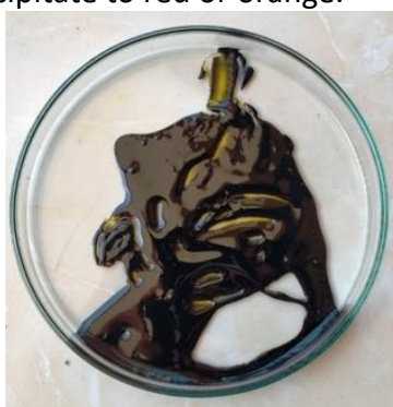
Figure 4. Phytochemical test results of tannin compounds using \text{FeCl}_3

The results of the phytochemical test of flavonoid compounds by reacting ethanol extract of avocado leaves ( Persea americana Mill.) with concentrated HCl and 3–4 pieces of Mg metal showed a color change in the precipitate to red or orange.