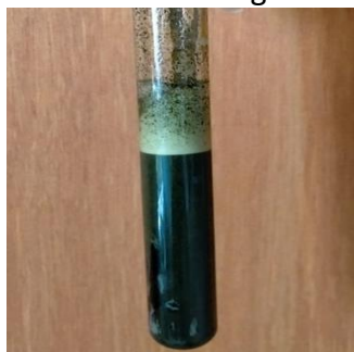
Figure 5. Phytochemical test results of saponin compounds using 10 ml distilled water and 10 ml alcohol

The results of the phytochemical test of tannin compounds by reacting ethanol extract of avocado leaves ( Persea americana Mill.) with \text{FeCl}_3 showed a green or bluish-black color change.