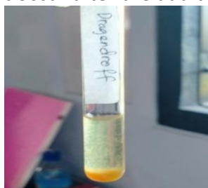
Figure 2. Phytochemical test results of alkaloid compounds using Dragendorff reagent

Based on the results of phytochemical tests of the ethanol extract of avocado leaves ( Persea americana Mill.) in the table, it is seen that avocado leaves contain chemical compounds in the form of alkaloids, flavonoids, tannins, and saponins. The presence of these chemical compounds is identified by the color changes that occur after the addition of reagents.